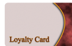
Marble Loyalty design