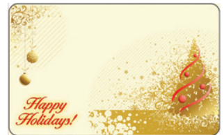
Happy Holidays design