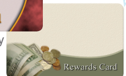
Cash Rewards design